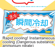
Rapid cooling! Instantaneous cooling (Dangerous substance: ammonium nitrate)