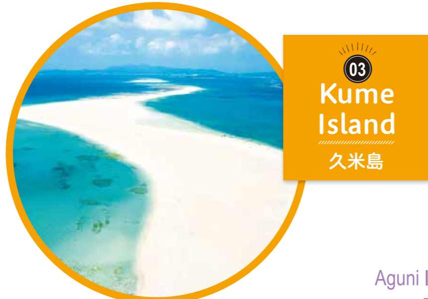
Hate no Hama