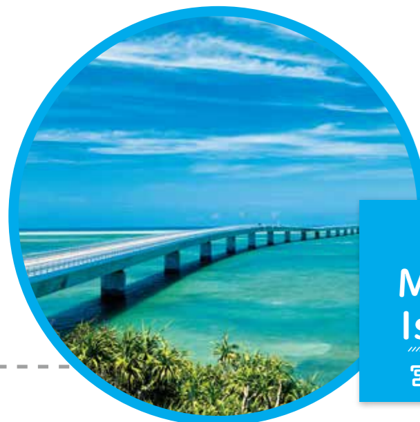
Irabu Ohashi Bridge