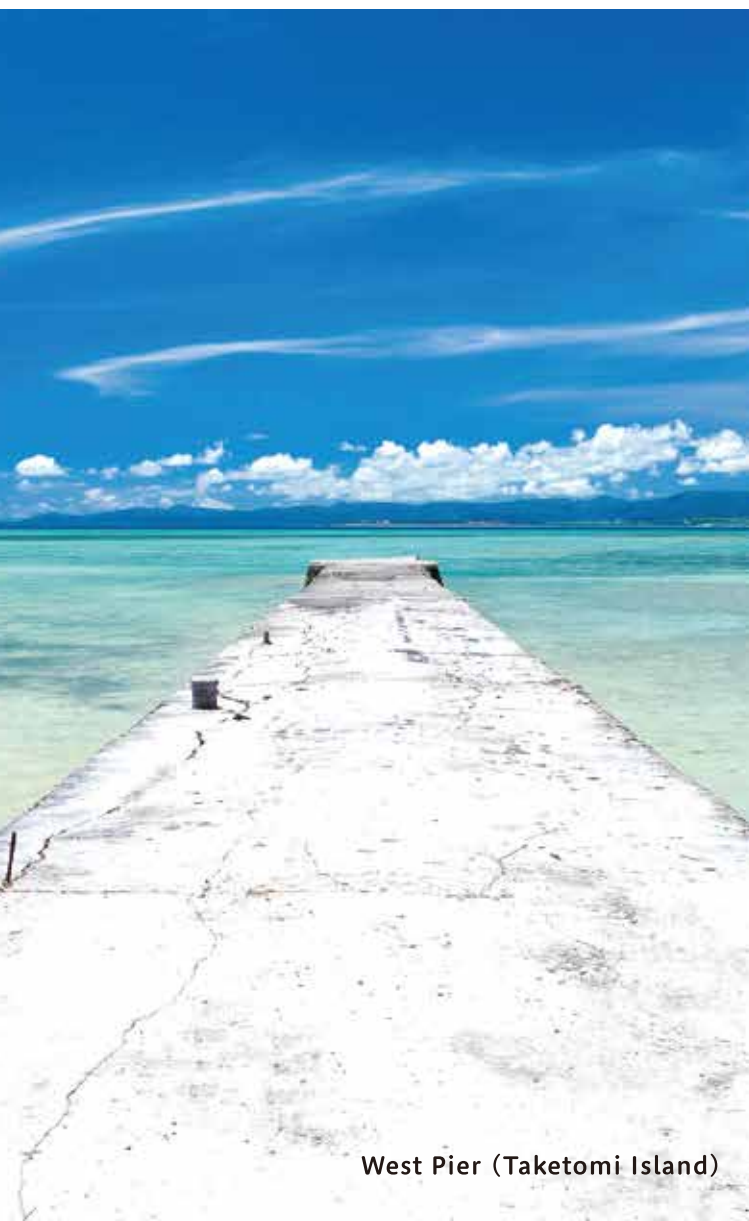
West Pier (Taketomi Island)