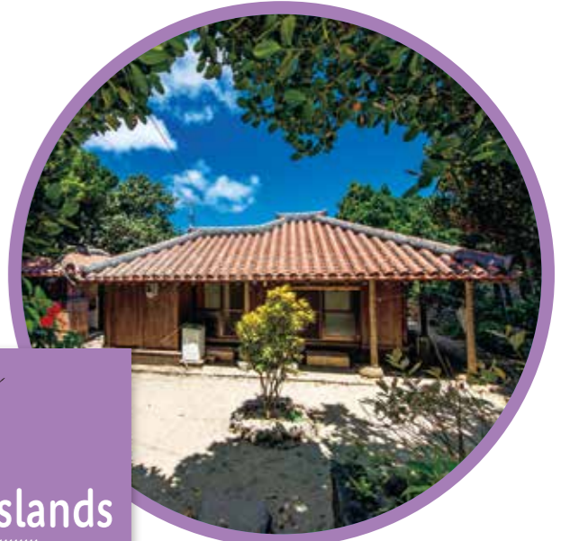
Residence with Red-Tiled Roof (Tonaki Island)